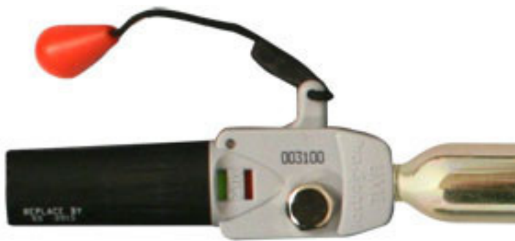
UML PRO SENSOR AUTOMATIC